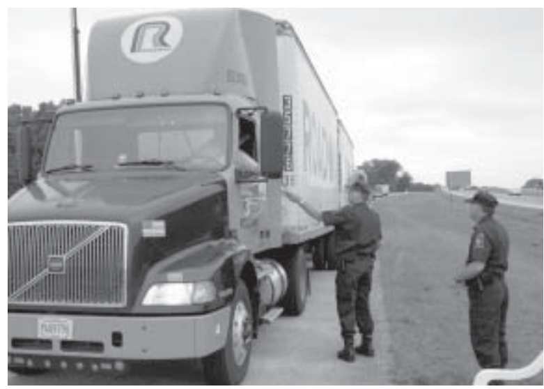
Officers hand out educational materials to truck drivers on Interstate 30.

In addition to roadside inspections, Roadcheck 2005 was also an opportunity to distribute educational and safety information to drivers passing through the inspection stations.