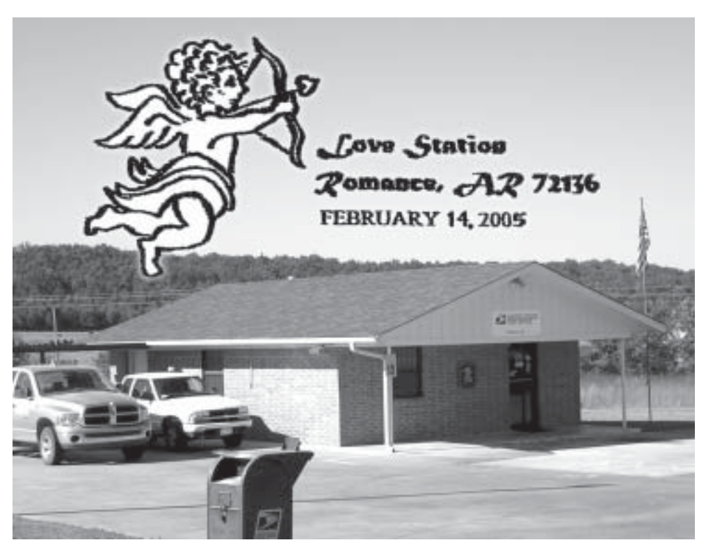
The U.S. Post Office in Romance.

Leaving Greers Ferry Lake, the highway begins to climb into the Ozark Mountains and eventually leads to the "Folk Music Capital of the World," Mountain View. Any evening of the week on Mountain View's historic Courtsquare, live music by local residents breaks out on every corner for those with time to listen and enjoy. Hometown and visiting musicians with banjos, guitars, dulcimers and fiddles play old folk songs of the Ozarks. There are also many music shows in town. The area around the Stone County Courthouse is the heart of a diverse shopping district and home to a variety of craft, gift and antique shops.