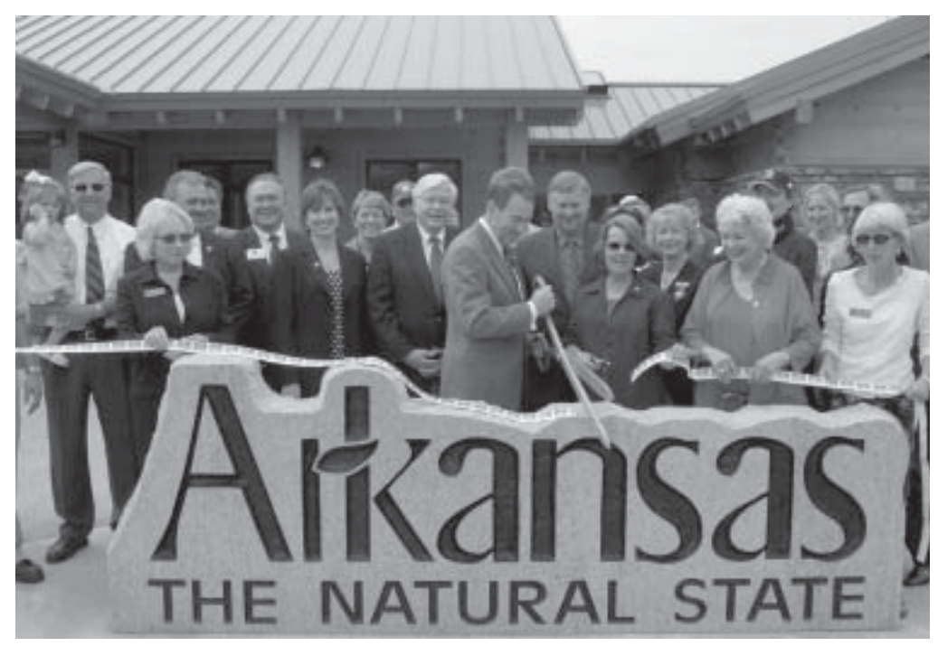
Arkansas Governor Mike Huckabee cuts the ribbon to dedicate the new Van Buren/Fort Smith Welcome Center. Members of the Highway Commission and the Department of Parks and Tourism were on hand, as well as local dignitaries.

The plan to rebuild up to eight of the Centers began in 2003 when the AHTD let contracts totaling $13.4 million to rebuild four new Welcome Centers in El Dorado, Texarkana, Van Buren/Fort Smith and Corning. The Corning Center will open in late 2005.