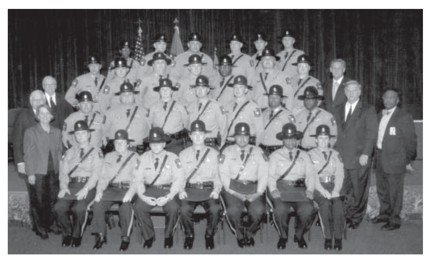
The 2005 graduating class of the Arkansas Highway Police.

In 2004, officers of the Arkansas Highway Police issued 199 drug citations, inspected just under 50,000 vehicles and weighed over two million trucks.