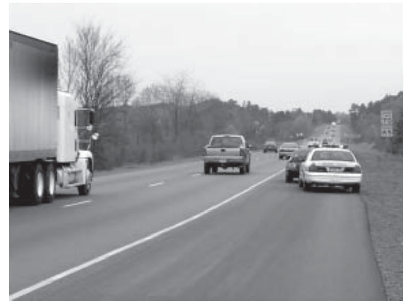
Highway Police stopped several motorists on Interstate 40 during Workzone Awareness Week.